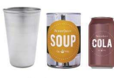
METAL CANS & CUPS

Non-hazardous, non-flammable material only.